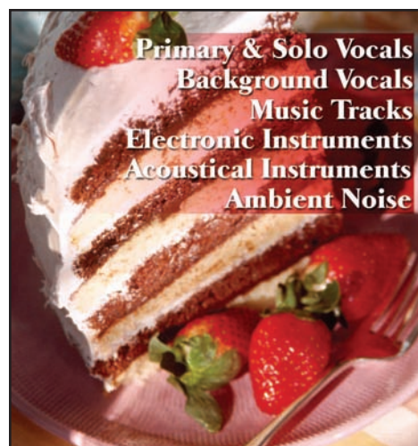
A multi-layer cake is similar to the layers of sound in a room. The layers build on each other.

The amount of ambient noise in the room establishes the base layer of sound. In other words, the air system, conversations, people moving, etc., create noise the sound system must overcome. The ambient noise will also change levels. For example, an empty room is much quieter than one filled with people.