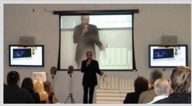
John Paul DeJoria, co-founder of Paul Mitchell Systems speaks at the Grand Opening of the new Partner School.

Paul Mitchell School envisioned an environment that goes above and beyond the basics of technology for their new facility in Normal, Illinois. They were looking for the latest in audiovisual technology to enhance their student learning experience.