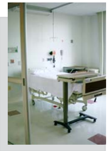
In the recovery area, the Dukane ProCare 1000 Tone and Light System is used for simple call notification.

In the Transitional Care Unit, the Dukane ProCare 6000 Advanced Healthcare Communication System was selected to provide the nurse call and integrated code blue notification.